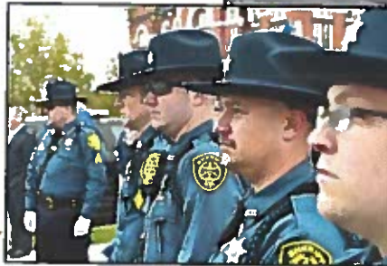
Miami County Above: Booking Left: Miami County Sheriff's Deputies at the ribbon cutting.